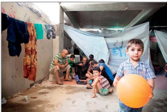
With no place to stay Assyrian Christians are forced to live underground in unfinished buildings.

On 21 June 2015, local media reported that ISIS had abducted 1,227 children aged between 9 and 15 years from various districts of Mosul. The children were reportedly being forced to undergo training at ISIS camps on the eastern outskirts of Mosul. On 23 June, the then-Ministry for Human Rights issued a statement confirming the abduction, adding that they were being held at the al-Salamiya camp in Mosul, and that those who resisted ISIS orders were whipped, tortured or sexually assaulted. The children were divided into two groups: those between 5 and 10 years old were placed in a religious education camp, and those aged between 10 and 15 were forced into military training. 38