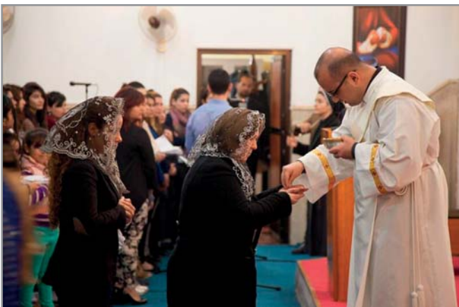
Christians at a Communion in Iraq.

Kaka'i, also known as Ahl-e Haqq or Yarsan, are estimated by community members to number between 110,000 and 200,000 in Iraq, mainly living south-east of Kirkuk and in the Ninewa plain near Daquq and Hamdaniya, with others also based in Diyala, Erbil and Sulymaniyah. 4 They are commonly considered a Kurdish subgroup and branch of the Shi'a faith, though the religion differs in important ways. The Kaka'i faith dates to the fourteenth century in western Iran