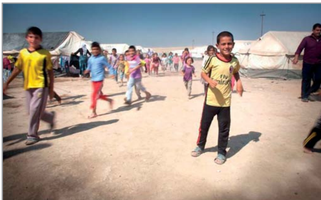
Yezidi children in a camp in Zakho, Iraq, near the Turkish border.

The IDP population in Iraq originates from 8 of the country's 18 governorates, though the majority of IDPs come from the governorates of Anbar (42 per cent) and Ninewa (35 per cent). Ethnic and religious minorities have been disproportionately affected: most of the minority population 107 have either sought refuge in the KR-I or in provinces in southern or central Iraq. 108